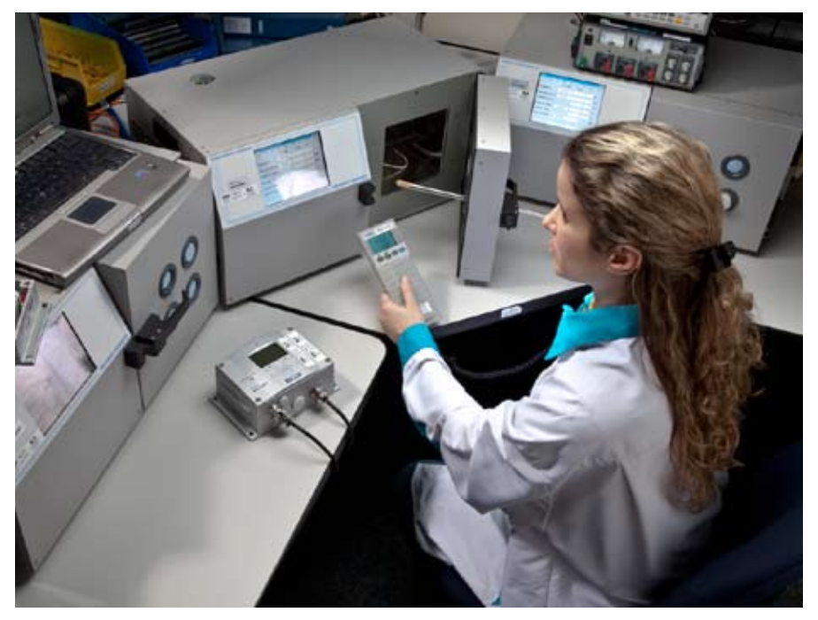
The environment will always have an effect on the function and accuracy of the sensors used in it.

Some instrument types and applications tend to be easier to define than others. A high-end digital multimeter used in a laboratory setting can be relatively straightforward. Many manufacturers will state 24-hour, one-week, onemonth, and one-year accuracies as well as provide guidance about the effect of temperature on the readings. The behavior of these types of equipment is well known and, in the grand scheme of metrology, relatively predictable. On the other end of the spectrum are instruments such as relative humidity meters. These are used in such a wide variety of operating conditions and environments that it is difficult for manufacturers to specify the right instruments for every application. Every environment is different and could have a different effect on the sensors.