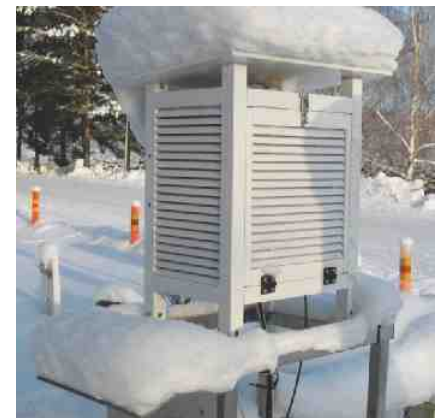
Figure 2: Two HUMICAP® instruments were mounted inside a Stevenson screen on the Vaisala test grounds in Vantaa, Finland. Sensor purge was also used.