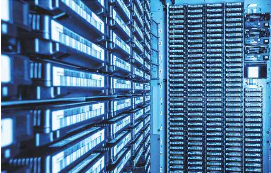
Inside a typical data center.

The modern world relies heavily on the internet and online services. Increasing demand for data processing and storage capacity has led to major companies such as Google, Microsoft, and Facebook investing in new facilities that provide web-based services to an ever-higher number of users.