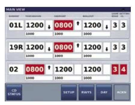
Controller Display - Main View

The displays report touchdown, midpoint and rollout zone RVR, and edge and centerline runway light step settings for up to three user-selected runways. LVAT limits for each zone can be selected from a touch screen menu.