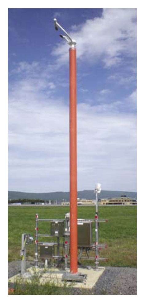
RVR Sensor Site

The Data Processing Unit (DPU) accepts and integrates data from up to 30 Visibility Sensors, two Ambient Light Sensors, 10 Runway Light Intensity Monitors and supports hundreds of Controller Displays. The high reliability of the DPU is achieved by using redundant servergrade computers and mirrored data storage.