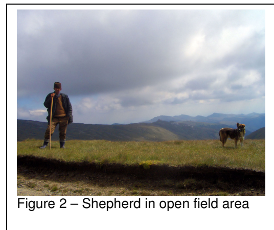
Figure 2 – Shepherd in open field area

Newspapers say that a lot of Romanian shepherds have died because of the lightning storms. The best-known lightning incident in Rural Area happened in summer 2001 in Neamt County, where there were seventy sheep and four people killed, according to TCM Breaking News. There are no official statistics about lightning's victims in Romania, but based on the fact that a sole thunderstorm in a small region took four lives, we can imagine how many lives lightning can take over one year in the whole country.