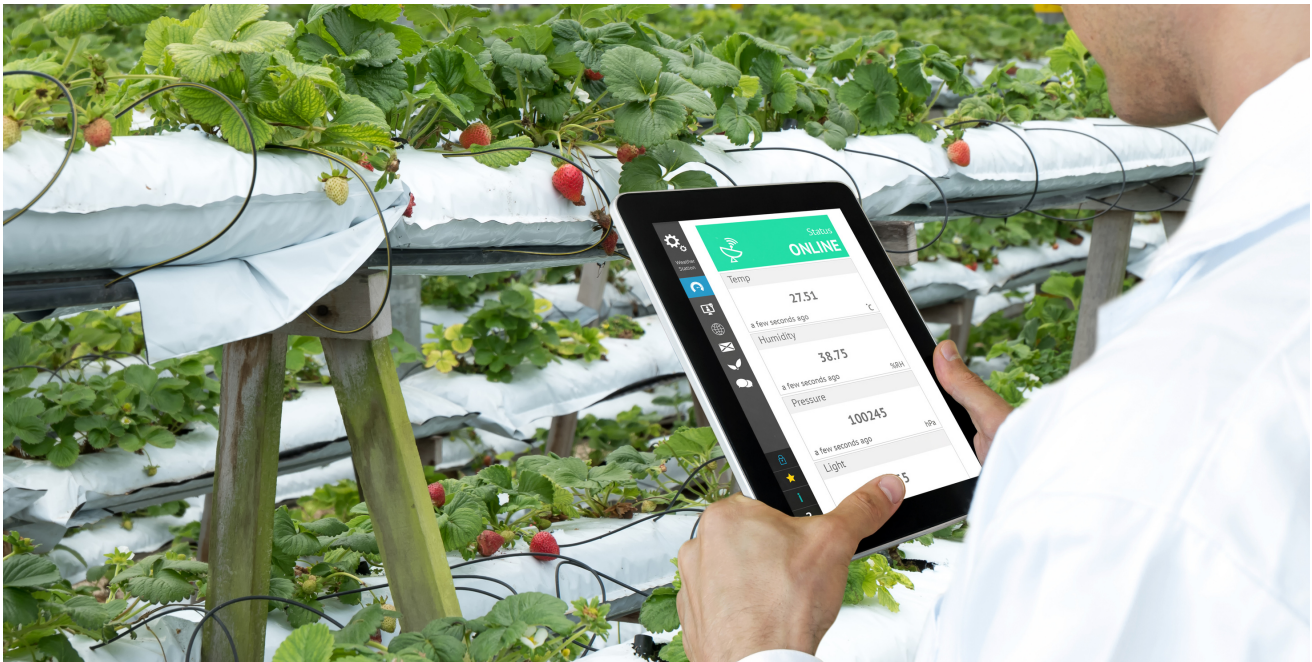
Greenhouse Climate Control

Science fiction movies and novels promised us a world of flying cars, autonomous robot housekeepers, and the power to control natural environments at will. So, where is that technology? Well, if you own a greenhouse, some of it is available now.