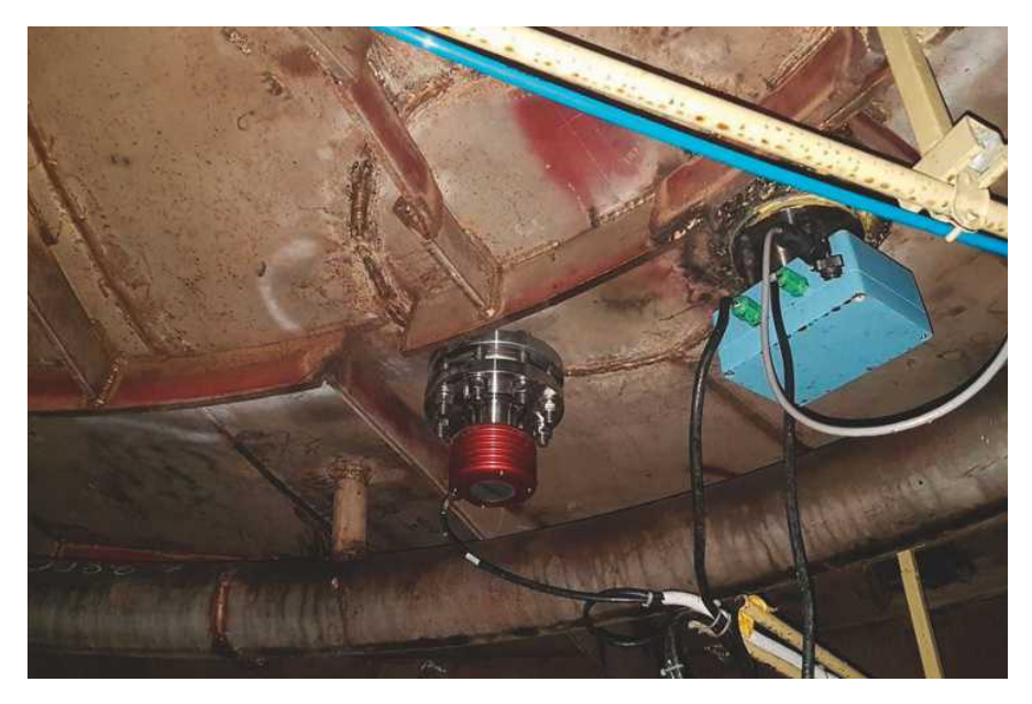
Image 3: Pan bottom showing a refractometer sensor and a microwave meter. Syrup is fed to the pan via a feeding ring.