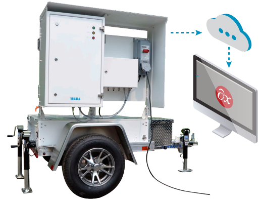
OPT100 Mobile Solution used with TOA Software

Once an initial assessment of the health of the transformer is complete, the OPT100 Mobile can either remain for ongoing monitoring or it can be moved to another gassing transformer identified through lab sample interpretation.